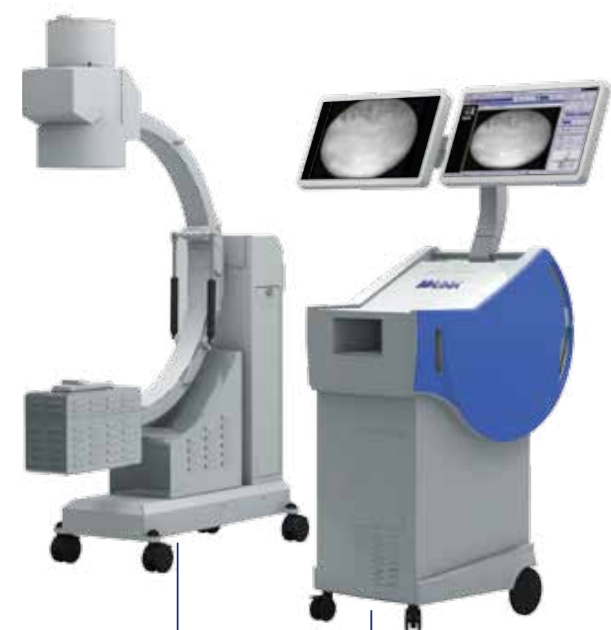
High frequency, Rotating anode, Up to 20 Rad/min