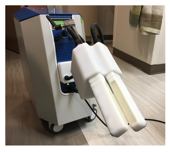
Fig. 1 - The MoreNova shockwave generator used for this trial.